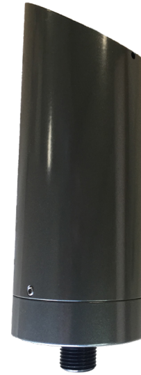
Shown in Bronze Powder Coat Finish (BZ)