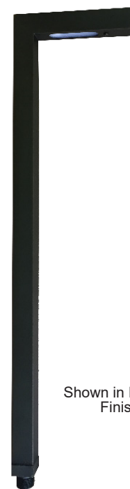
Shown in Dark Bronze Finish (DB)