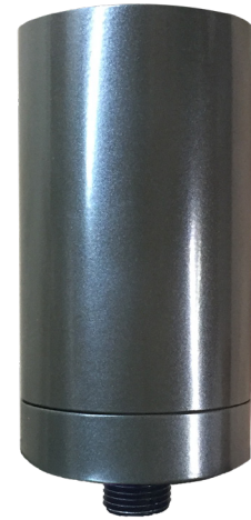
Shown in Bronze Powder Coat Finish (BZ)